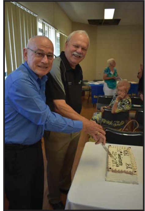
Recent photos of the 50th Anniversary of History Redcliffe celebrated on 23rd February 2017.