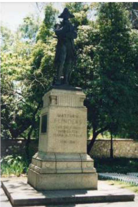
statue of Matthew Flinders in North Terrace Adelaide 2001.

After arriving in Port Jackson on 9th May 1802, Flinders was soon ready to set out to complete the circumnavigation of our continent in Investigator .