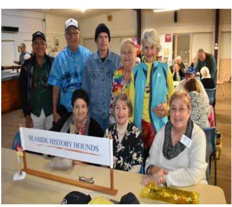
Seaside History Hounds