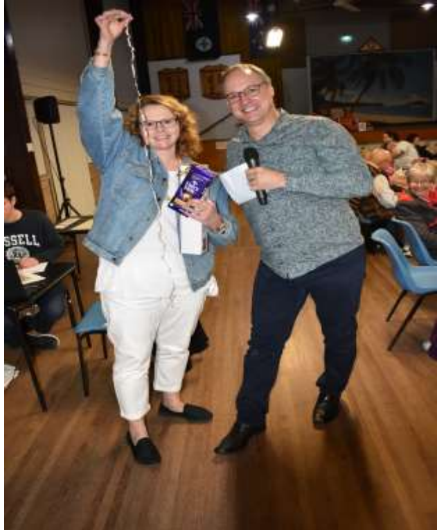
Mintie Comp winner