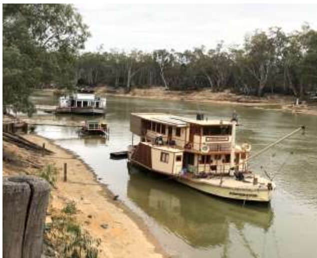
Paddle Steamer on the Murray River at Echuca