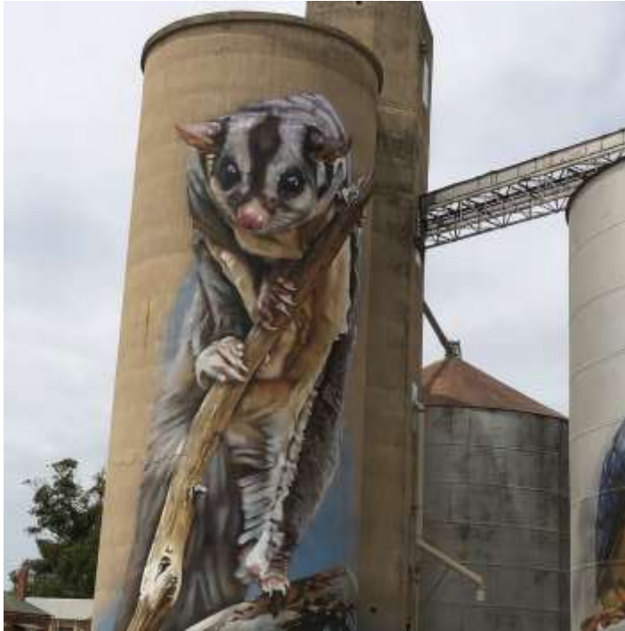
Photos of Grain Silos at Rochester, Vic showing the Squirrel Glider and King Fisher done to promote tourism